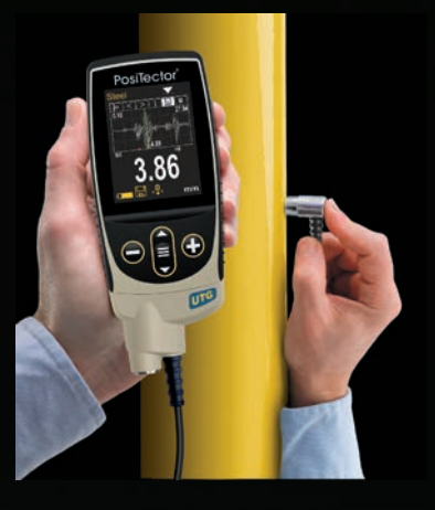
UTG M Thru-Paint models measure the metal thickness of a painted structure without having to remove the coating.

Measures the wall thickness of materials such as steel, plastic, and more